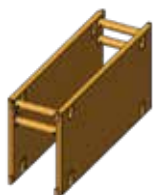
STEEL TRENCH SHIELD