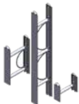
VERTICAL HYD SHORING