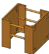
STEEL MANHOLE BOX