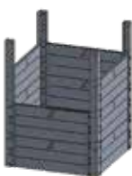
ALUMINUM MODULAR PANELS