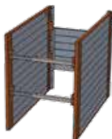
STEEL FRAMED ALUMINUM SHIELDS