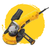
Grinders & Saws