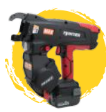
Tie Wire Guns