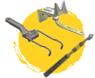
Camlocks, Turnbuckles, & Strongbacks